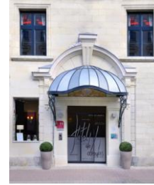
Originals Hotel - Le Londres