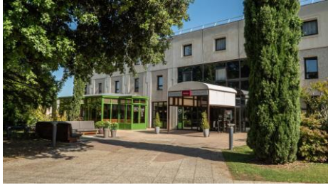
Mercure Niort Marais Poitevin